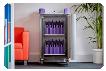
LapCabby Mini 20V