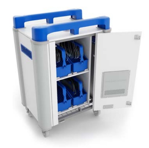
TabCabby 16H Compact